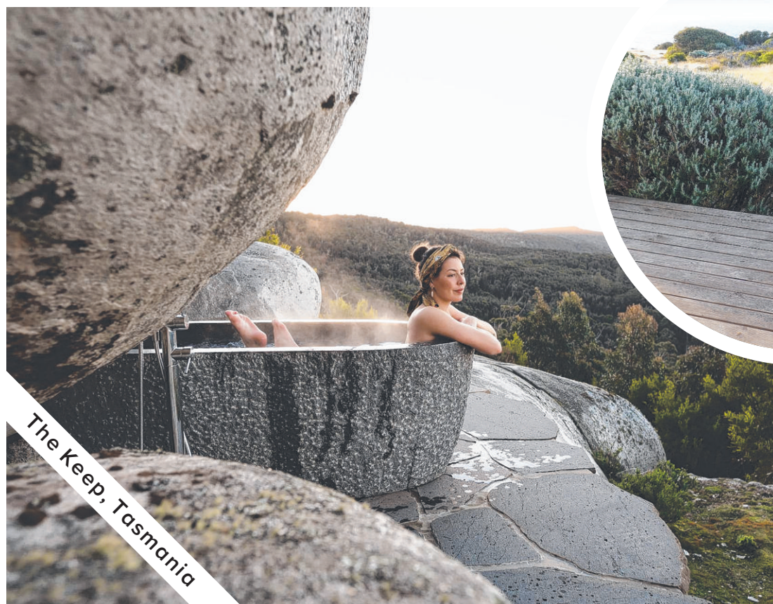
The Keep, Tasmania

highlights include two scenic bathtubs, a wood fireplace, and spectacular views, while outside, there's a private courtyard with pool and fire pit, plus private access to beautiful Werri Beach and the Kiama Coastal Trail. Stays are priced from $2750 a night. dovecote.com.au