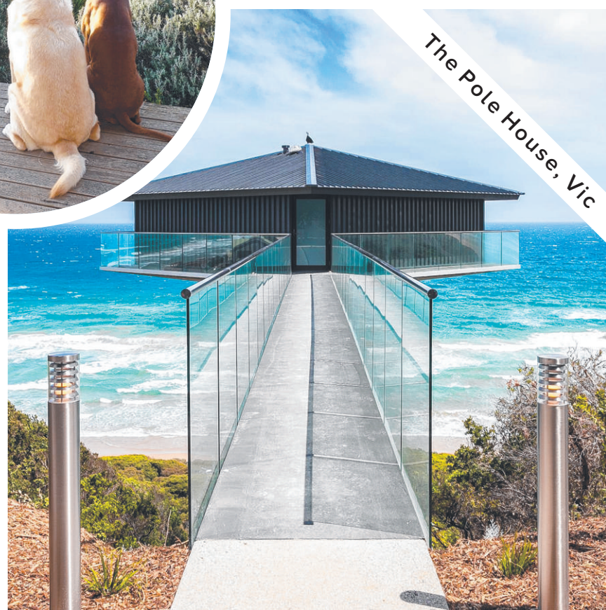
The Pole House, Vic