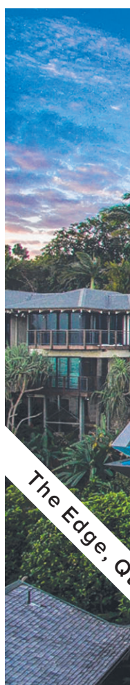
The Edge, Queensland