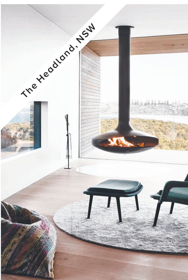
The Headland, NSW

accommodation scene. Built for two, but spread over three storeys, this one-bedroom home is utterly remote – 20km from any other building. Standout features include an outdoor granite bath, secluded among giant boulders, and a handmade granite fireplace. Besides 360-degree wilderness views, local attractions include Tasmania's largest myrtle tree, a 10-minute walk away. Rates circa $960 a night. thekeepstasmania.com.au